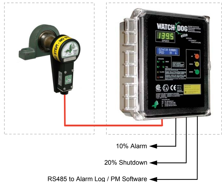
Watchdog™ Elite Display & Control Unit