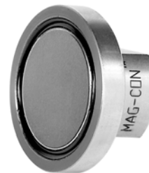
Mag-Con™ Magnetic Connector (Optional Accessory - Whirligig)

Whirligig: U.S. Pat # 6,109,120 Mag-Con: U.S. Pat # 6,964,209